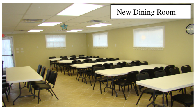
New Dining Room!

3 rd Sunday Every Month. Oxford Veterans Home Visit.