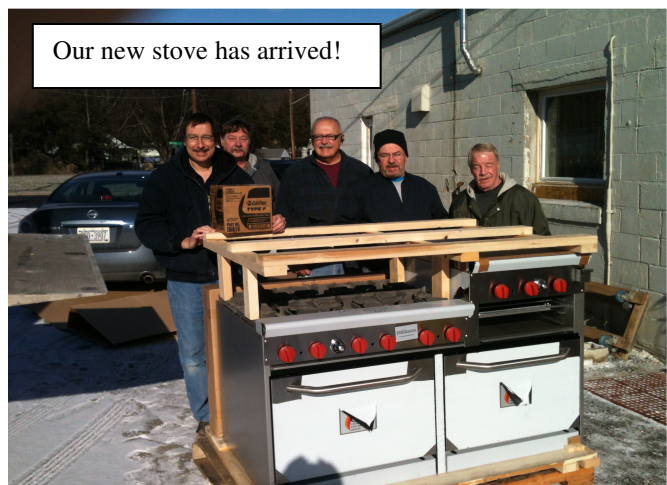
Our new stove has arrived!