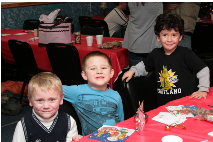
Mom's House Christmas Party